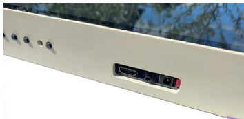
Power & video